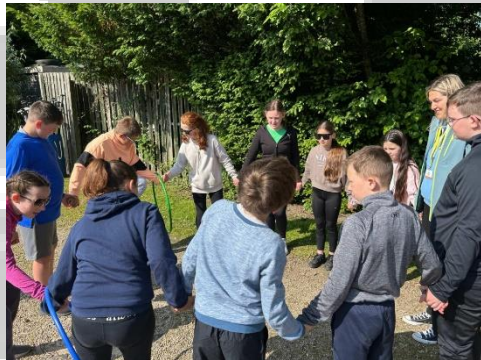
Year 6 at Kingswood