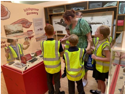
Pathfinders at the Yorkshire Museum